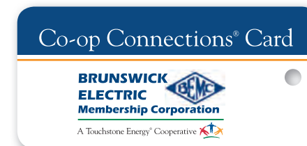
Front of Key Fob