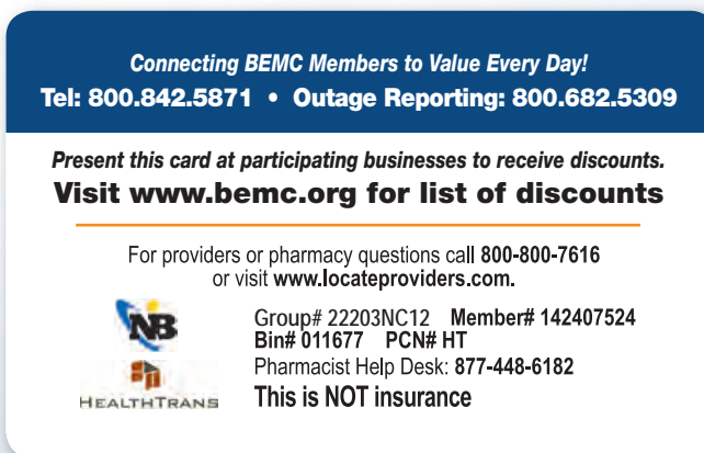
Back of Card

Participating businesses have the choice to opt out of the program at the end of every year or change their offer.